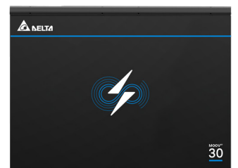
Secondary Unit (WSU)