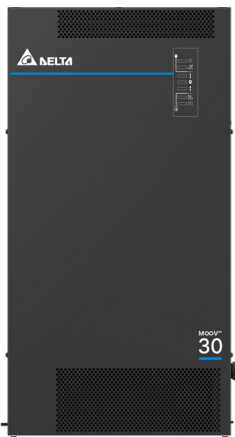
Primary Box (WPB)