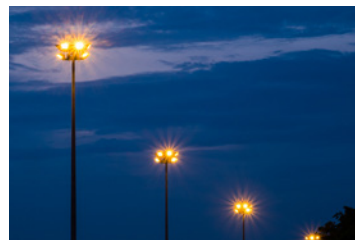
High Mast Lighting