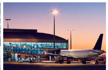
High Mast Lighting