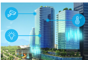
Building & Home Automation